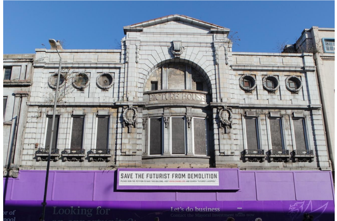
The Futurist Cinema.

The Merseyside Civic Society submitted a listing application for the street in June this year in which they wrote of Lime Street: "The whole group represent a range of urban development in central Liverpool between 1780 and 1910 of which such evidence is being eroded. These undesignated heritage assets, although compromised by some alterations, have the potential to be brought back into full beneficial use, with careful adaptations with a view to retaining their important contribution to the overall character and appearance of this part of the City's historic fabric."