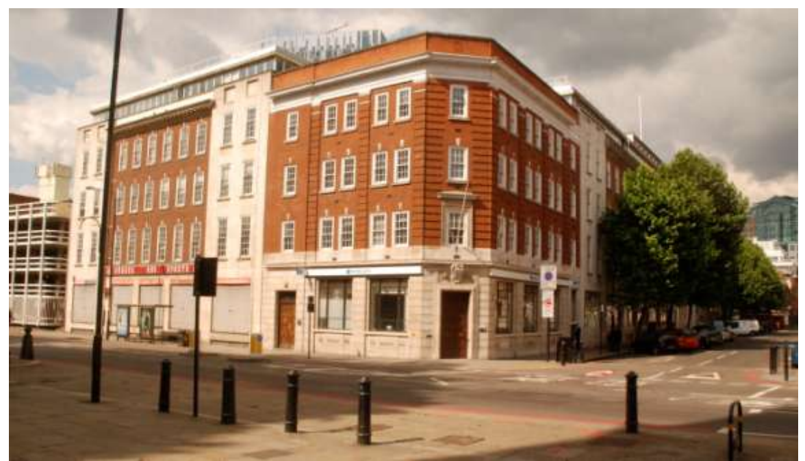
View of the Barclays Bank on the corner of Commercial Road and Brushfield Street, as seen from Christchurch Spitalfields.