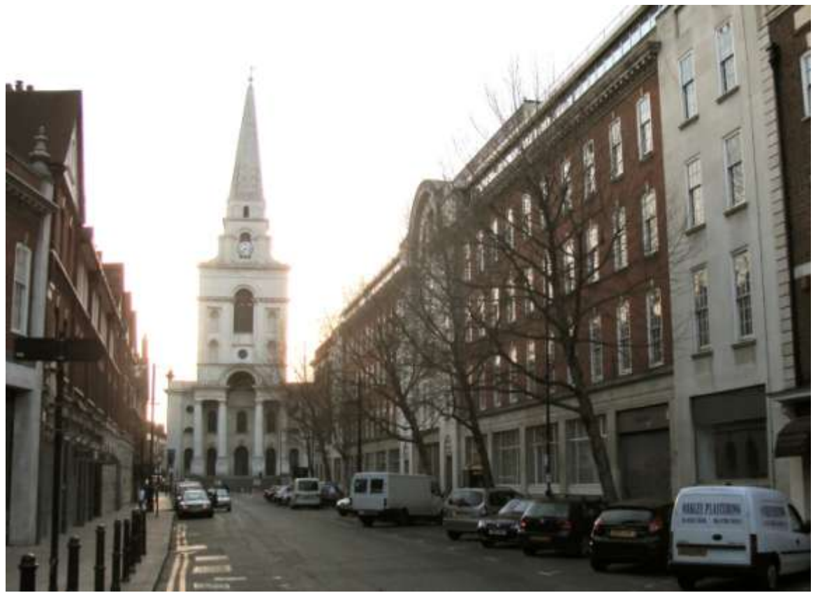
View of Christchurch Spitalfields along Brushfield Street today