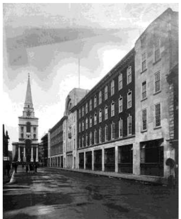
1929 Vista of Christchurch Spitalfields with the new London Fruit and Wool Exchange to the Right

SAVE President Marcus Binney says: "The Exchange frames the finest vista of any church of London – the view of Hawksmoor's masterpiece Christ Church Spitalfields from Bishopsgate and the City. The Corporation's Surveyor designed a whole island block to complement the church, with matching market buildings on the other side of the street – just in the way that St Paul's Cathedral was surrounded by warm red brick houses in Christopher Wren's London. Preserving just one façade of a building with four show fronts and an interior which is complete apart from the woodwork of the auction rooms will be a pathetic example of tokenism. Maria Miller should stand up for the Exchange in the way her courageous predecessor Geoffrey Rippon stood up for historic buildings in Covent Garden, with results that delight everyone to this day"