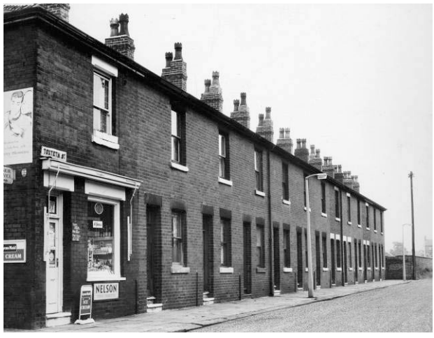
Toxteth Street in the 1960s. 'Unattractive monoculture' or model of sustainable urban development?

Despite continued questioning, none of the council's witnesses could supply any figures for the cost of the proposed redevelopment project. This was particularly galling in light of the fact that SAVE's costings were continually analysed and criticised by the opposition's counsel. Another startling hole in the council's case was its admitted failure to take into account the embodied energy of the houses it wanted to demolish or make any arrangements for recycling the building materials. Throughout the inquiry the council's barrister referred to the characterful existing terraces a 'monoculture' of 'unattractive' housing - providing confirmation of the council's complete failure to understand, appreciate or value the city's most successful housing model.