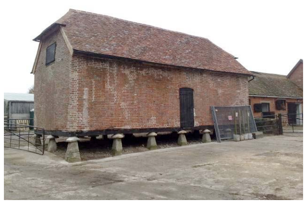
Barford Granary, back on its staddle stones again thanks to SAVE

The good news from Wiltshire is that repair works to Barford Granary are now complete. These works, carried out under the supervision of local engineer and builder Ian Payne, involved the stabilisation and levelling of the structure and the repair and recovering of the roof.