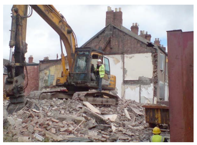
The 'insane' demolition of terraced housing in Gateshead

SAVE has recently scored another notable legal success, this time in Gateshead, where we have succeeded in halting the demolition of some 140 houses as part of Pathfinder scheme in the Saltwell and Bensham area. Details of this scandalous case appeared in the last SAVE newsletter - plans involve the demolition of some 400 sound houses in a pleasant area of the city to make way for ...well, nothing. Locals have been fighting these demolitions since they were first proposed in 2004 and so far the council has succeeded in flattening just one terrace and grassing it over. In September, when demolition work started on the other side of the street, SAVE decided it was time to act. Our superb legal team (see Clarence Street) succeeded in securing a Judicial Review against the council for its failure to carry out an EIA (Environmental Impact Assessment) screening opinion. The council, acknowledging its error, conceded, agreeing to pay full costs.